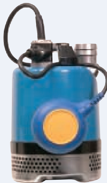
LB 480 automatic