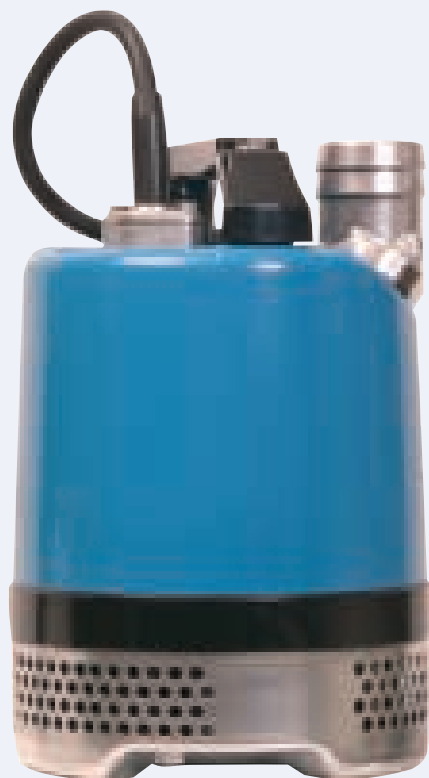
LB 480 manual